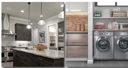
Lights control Laundry machine control